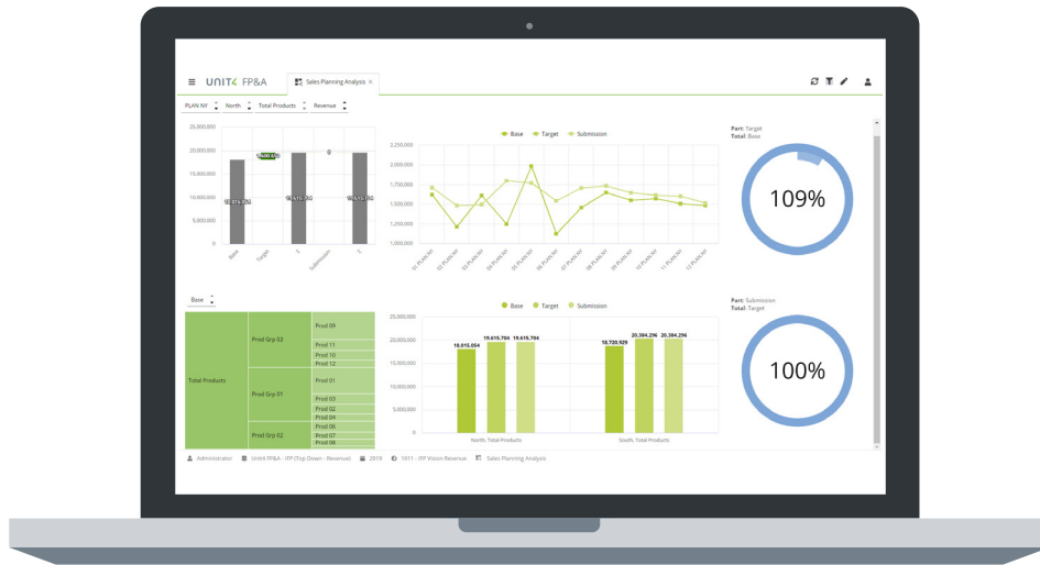
Fig. 1 Management Dashboard