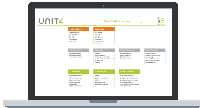
Fig. 1: Workflow for the statutory consolidation process

Unit4 Financial Consolidation has been created by experts responsible for the consolidation process. Thanks to their insights and experience, it follows a clear workflow and helps you and your subsidiaries import and collect information in a reliable, efficient and very user-friendly way.