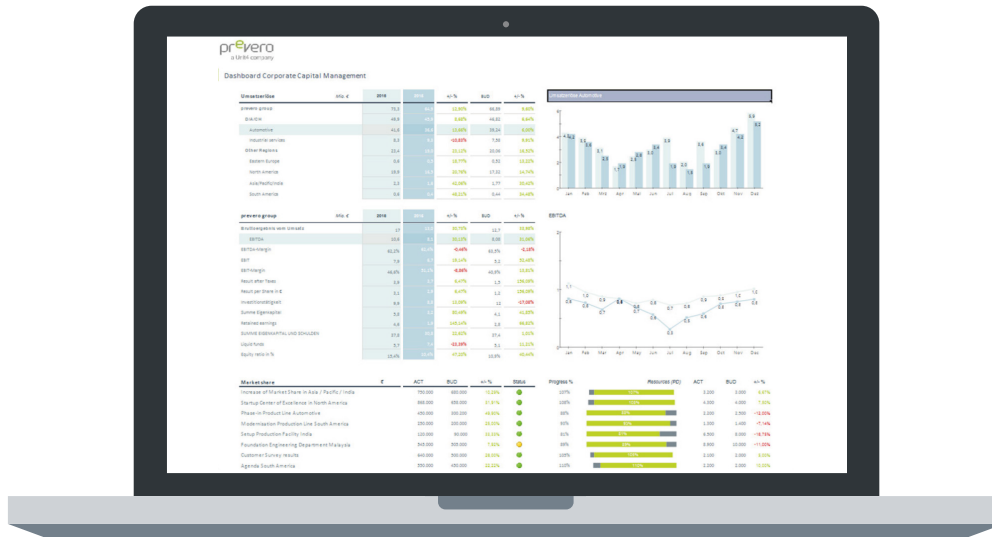
Fig. 3: KPI dashboard