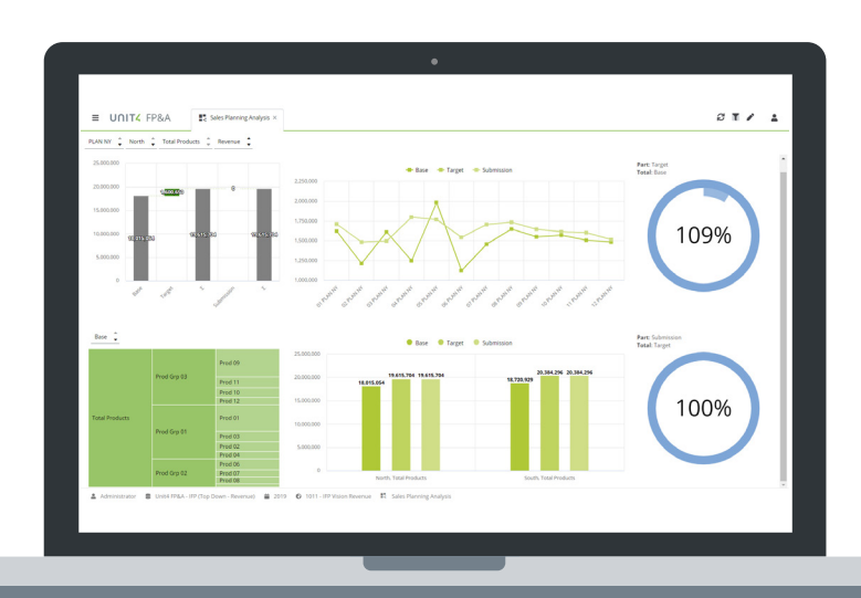
Fig. 1 Management Dashboard